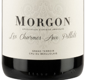
DOMAINE DE COLONAT